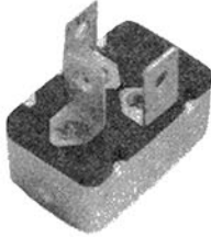
Part No. 68543-61 Signal Stat N 221-6V For Direction Signals Only